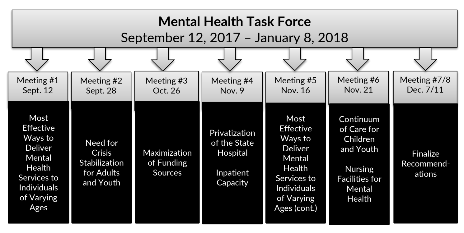
Figure 2. Overview of Mental Health Task Force Meetings by Dates and Topics

The Task Force was convened by the Kansas Department for Aging and Disability Services (KDADS). The Task Force consisted of 11 legislatively appointed members that included behavioral health providers, advocacy organizations, citizens with lived experience, and other behavioral health experts. In addition, the attendees included several KDADS staff members and a representative from the Kansas Legislative Research Department (KLRD). The meetings were facilitated by the Kansas Health Institute (KHI). The role of KHI was to develop and provide materials in advance of the meetings, facilitate discussions, research information, and ensure that the objectives of each meeting had been met.