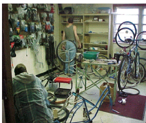
In-stock parts room.